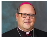
Bishop Edward C. Malesic Bishop of Diocese of Cleveland Speaking at 3:00 PM Celebrating Mass at 4:00 PM