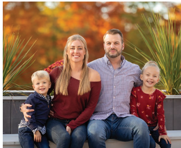
The Krok family