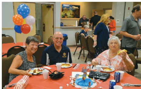
Sharing in fellowship and great food at last year's picnic