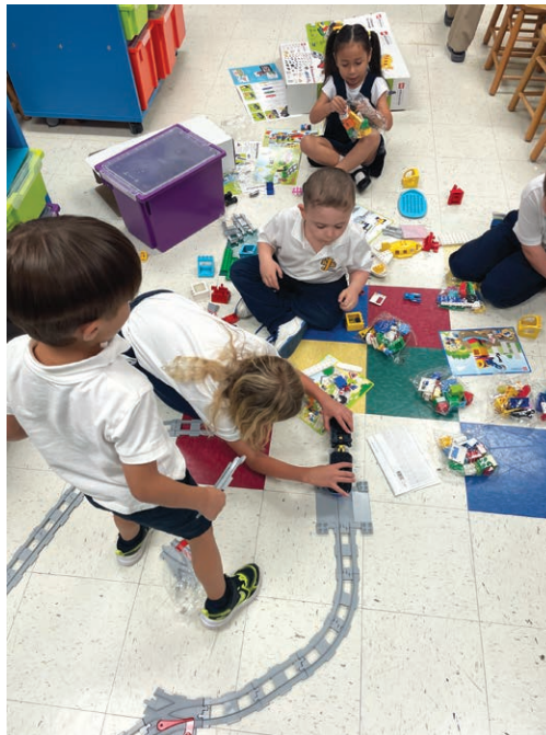
Students work on a fun building project.

“Ultimately, my goal is to help every child and family who walks through our doors to feel loved and seen. With the support of our dedicated teachers, staff, and families, I believe the 2025-26 school year will be a year of great growth and grace.”