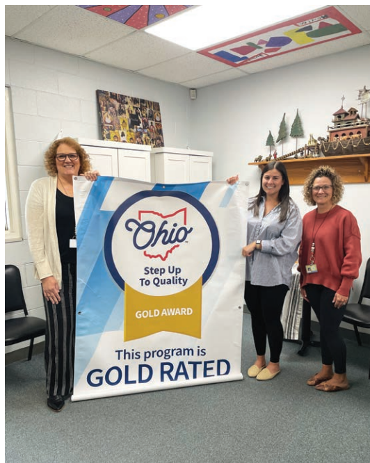
Our preschool staff received their Gold Award banner.