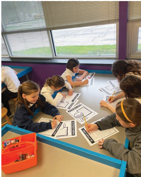
Third-graders work on their Starting a Business PBL.

To learn more about St. Joseph Parish School, visit sjsamherst.org .