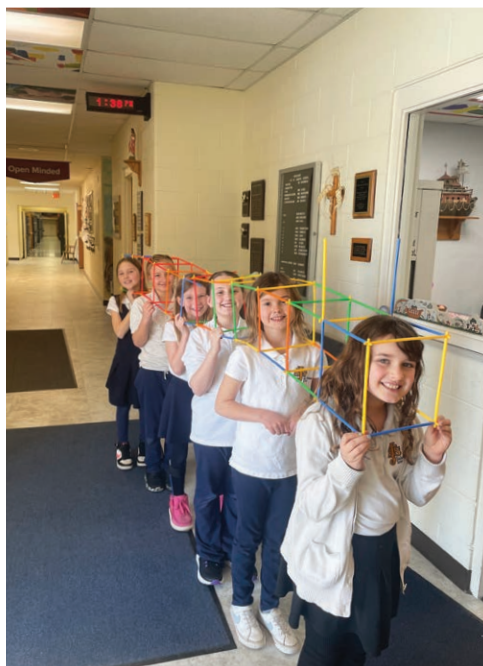
Third-graders use collaboration time to build together.