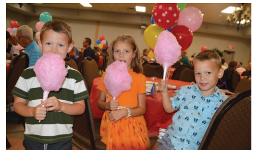
Young attendees enjoying time together at last year's picnic