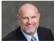
Elvis Grbac Retired NFL quarterback and motivational speaker.

OUTSTANDING MUSIC • SACRAMENT OF RECONCILIATION • MASS Continental Breakfast and Lunch