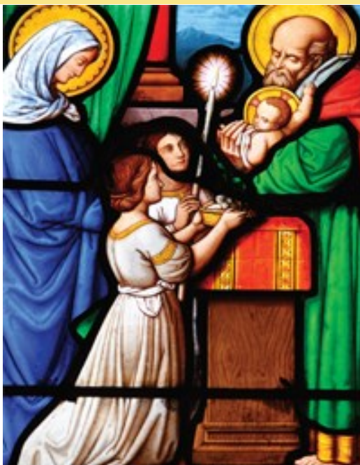
The Presentation at the Temple WORLD DAY FOR CONSECRATED LIFE

This Sunday, we celebrate World Day For Consecrated Life . We recognize and give thanks for those who have consecrated their lives to God and the Church through the vows of poverty, chastity, and obedience. The consecrated life is one way that women and men live out their baptismal commitment as followers of Jesus. Please pray for all those who have made commitments in the consecrated life, and be sure to thank them on their special day.