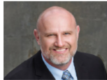
Elvis Grbac Retired NFL quarterback and motivational speaker.

OUTSTANDING MUSIC • SACRAMENT OF RECONCILIATION • MASS Continental Breakfast and Lunch