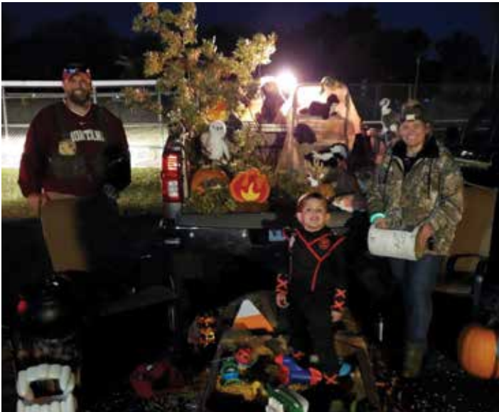
The winner of "best trunk" at the 2022 Trunk-or-Treat event