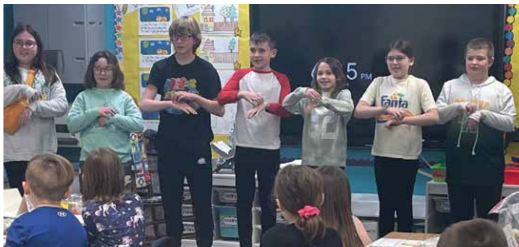
Fifth-grade PSR students share a lesson with the first-graders.