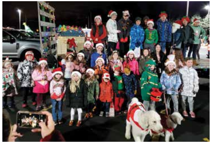
Students having fun around the 2022 Christmas float for the Amherst Christmas Parade